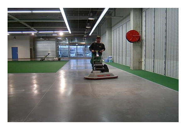
Decathlon Lyon France PS ®

Manufactured exclusively by Convergent Group S.A. & Convergent Concrete Technologies