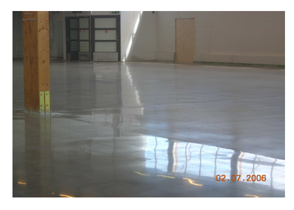
Hardware Store Helsinki Finland Pentra-Sil ® 244+