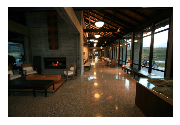
Golf Club New Zealand Pentra-Sil® + Pentra-Guard (HP)