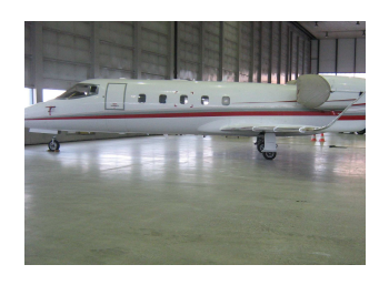
Jet Hangar Germany